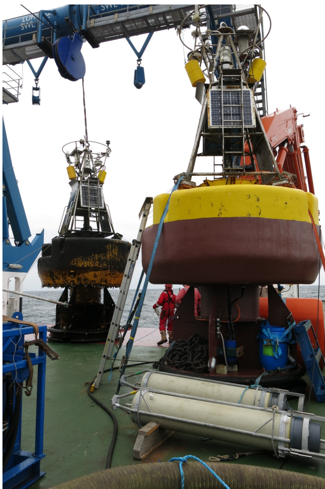
A tale of two buoys. The 2016-2017 buoy was recovered before the new buoy was deployed.

some discrepancies in estimating the magnitude and composition of carbon export and the strength of the biological carbon pump before the start of the EXPORTS (NASA funded, US run) and COMICS (NERC funded, run by NOC) programs which focus on further understanding the biological carbon pump.