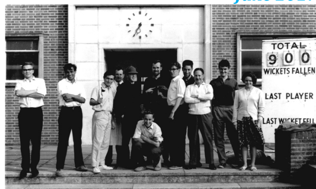
Cricket, summer 1964

In the summer of 1964 I had my first experience of oceanography (and limnology) as a member of the Menai Bridge, Marine science Labs 2-week vacation course. This also involved a cricket match between the course members (shown in the attached photo) and laboratory staff.