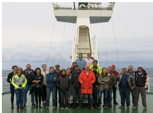
Team photo before we headed back to land

A wide range of exciting science was carried out on-board with more detailed accounts on the PAP Site blog https://papobservatory.wordpress.com . The cruise was a great success with a fantastic team of scientists, technicians and crew on-board.