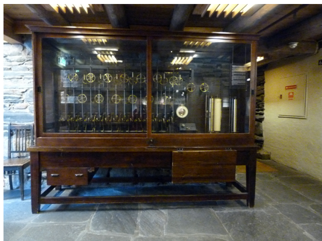
'Sagar No. 18' in Stavanger

Tide predicting machines would typically have a few tens of these cog wheels so that the important harmonics at a port could be included in the prediction. The wheels would be specially made for each port. As a result the machines would have been expensive and made only for busy ports where the tide was important.