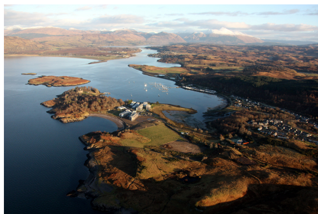
Aerial view of the European Marine Science Park and SAMS UHI

The summit was organised by the University of the Highlands and Islands, the Scottish Association for Marine Science (SAMS) and the Texas A&M-Corpus Christi (TAMUCC), where the Harte Research Institute for Gulf of Mexico Studies is located. Highlands and Islands Enterprise (HIE), which developed the host venue, supported the summit. Staff from other University of the Highlands and Islands' partner colleges also attended the workshop.