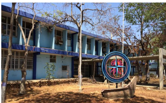
Main entrance of the Oceanographic Institute of Venezuela-Universidad de Oriente, Cumaná-Venezuela.

In celebration of its 50 years, the Oceanographic Institute hosted the 62 Gulf Caribbean Fisheries Institute (GCFI). During that meeting, there were over 300 scientists from the region that participated, and Dr. Daniel Pauly provided the keynote speech. However, now on its 60th anniversary, the days of providing a higher-level education in oceanography, marine biology and fisheries, making the science accessible to the public are gone, in part due to insufficient allocation of financial resources in recent years and mostly due to the vicious vandalism that the Institute has endured since the beginning of this year.