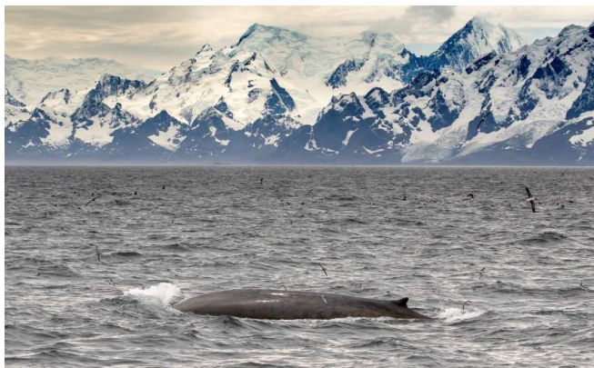
An Antarctic blue whale surfaces off South Georgia.