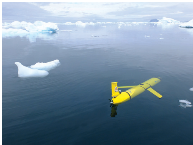
A glider in Antarctic waters

The huge iceberg, which broke away from Antarctica's Larsen C Ice Shelf in 2017, is now 3900 km 2 in area, and satellite images have revealed that it is currently heading towards South Georgia, with the potential to severely impact wildlife habitats in the region.