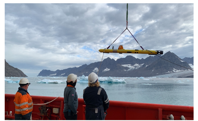
SAMS researchers will use marine robotics to help assess ice melt and ocean currents in Greenland.

- Improving computational models to better predict tipping points and their consequences.