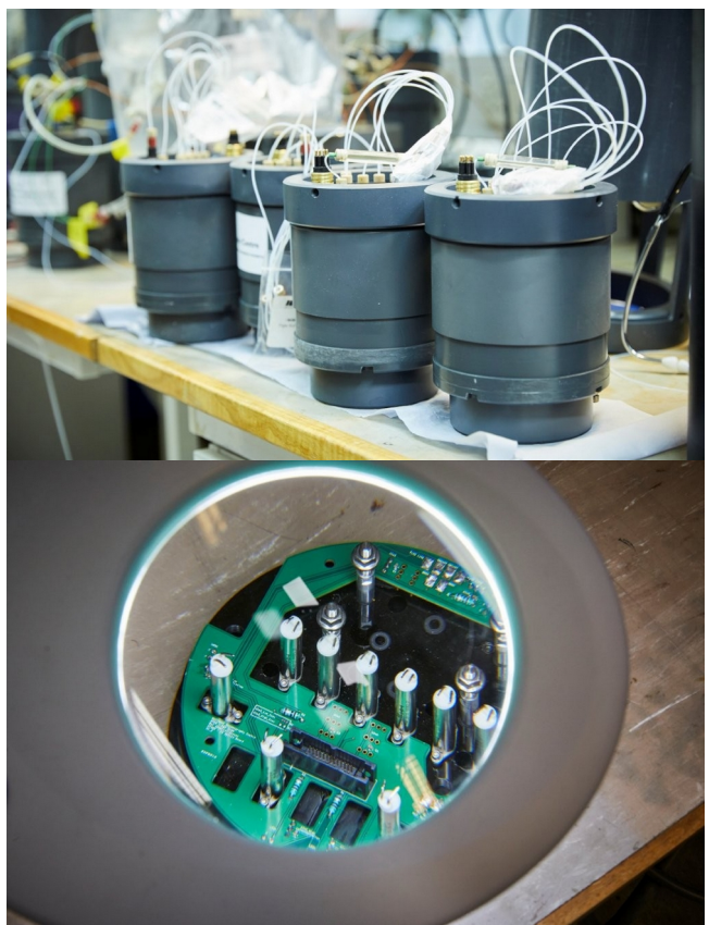
Sensor development at NOC.

temperature, dissolved oxygen, pressure, pH and Eh), to be integrated onto ALRs, gliders and other platforms, such as submersibles and profiling floats.