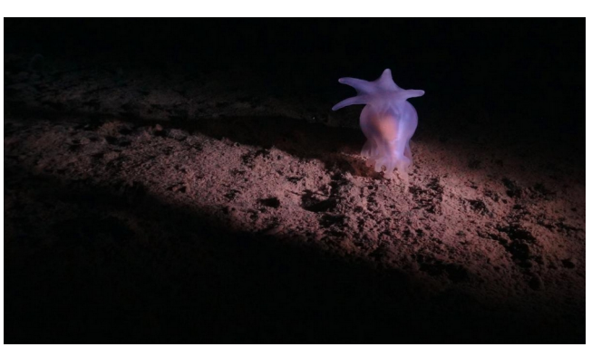
The CCZ is home to unique and biodiverse deep-sea creatures.

under international law, is deciding whether to allow deep-sea mining in the region and under what conditions. A key question in this decision, is whether deep-sea ecosystems can recover from mining disturbances.