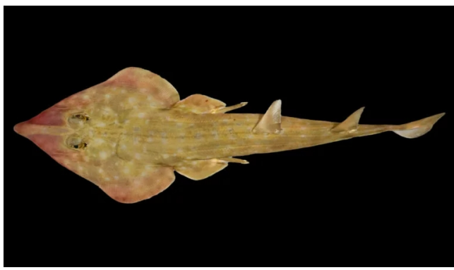
Guitar Shark

The identification and official registration of a new species can take up to 13.5 years, thus some species may go extinct before they are even documented. To address this, The Nippon Foundation and Nekton jointly launched the Ocean Census in April 2023 to transform species discovery, accelerating the identification of marine life to close critical knowledge gaps before it's too late.