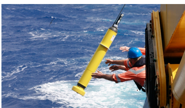
Researchers deploy an Argo float into the sea to gather data throughout the water column.

the ocean, improve climate and weather forecasts and ultimately help society prepare for environmental change.